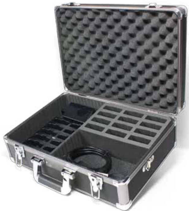
CHG 1012 PRO