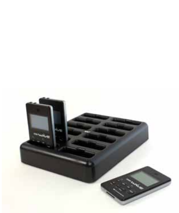
CHG 1012 with DLT 100's (sold separately)

Multi-bay, drop-in style charger. For use with the Williams Sound Digi-Wave™ DLT 100.