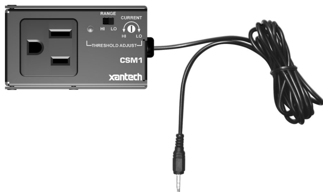
Figure 1 – CSM1 MRC44 Current Sense Module