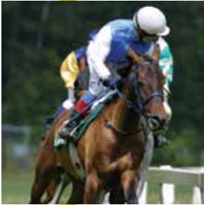
Casinos & Betting Shops