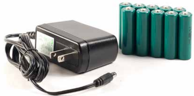
RC-30 Rechargeable Battery Kit

CAUTION: NEVER recharge other types of batteries. Doing so can result in battery explosion. Use only rechargeable Nickel-Metal Hydride (NiMH) batteries.