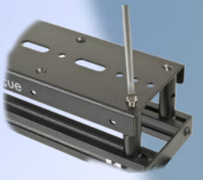
4. Re-fix the camera plate using the four screws provided.

3. Install four camera plate pillars of the appropriate height.