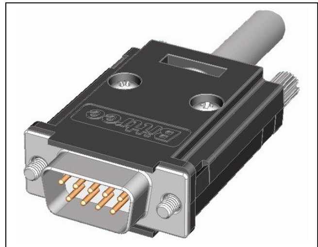
Figure 2 – The DE9 Slim Hood Plug

This patchbay is designed to mount in a standard rack, which limits the width of its chassis to 17.5 inches. On the other hand, the patchbay is designed to accommodate the industry-standard two rows of 32 connections. Therefore, the resulting small distance between adjacent DE9 connectors on the rear panel may preclude the use of cables with standard-size DE9 connector hoods. For this reason, Bittree has designed a special narrow connector hood, the DE9 Slim Hood shown in Figure 2, which allows users to fit up to 32 connectors in each row and take advantage of all 64 patchbay ports. The DE9 Slim Hood is easy to assemble, comes with a rugged tie-wrap strain relief to ensure solid connections, and features slotted thumb screws for maximum convenience.