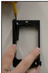
*1-Gang Model Shown