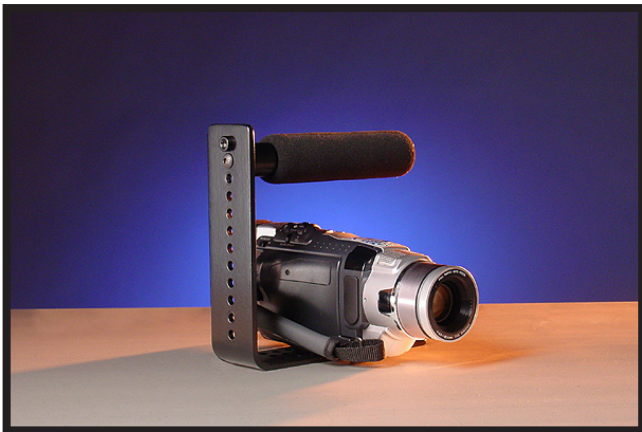
The Glidecam Stunt Bar at 7"

There are several different configurations for the Glidecam Stunt Bar and it's positionable lengths ranging from 7" to 27". It may be used with cameras up to 7 lbs in weight.