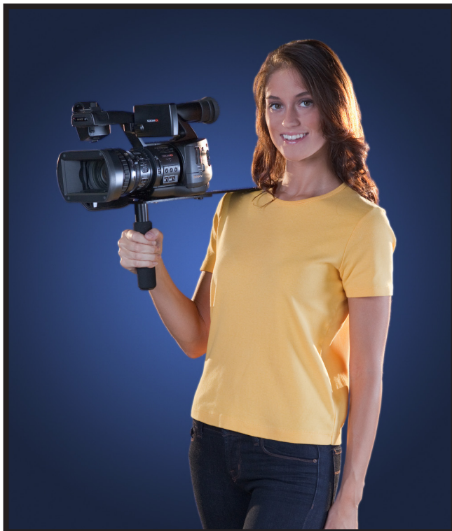
The Glidecam Stunt Bar being used in Shoulder Mode.