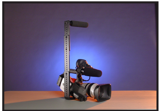
The Glidecam Stunt Bar at 11"