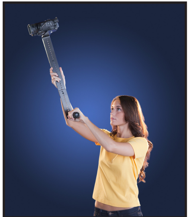
The Glidecam Stunt Bar being used in High Mode.