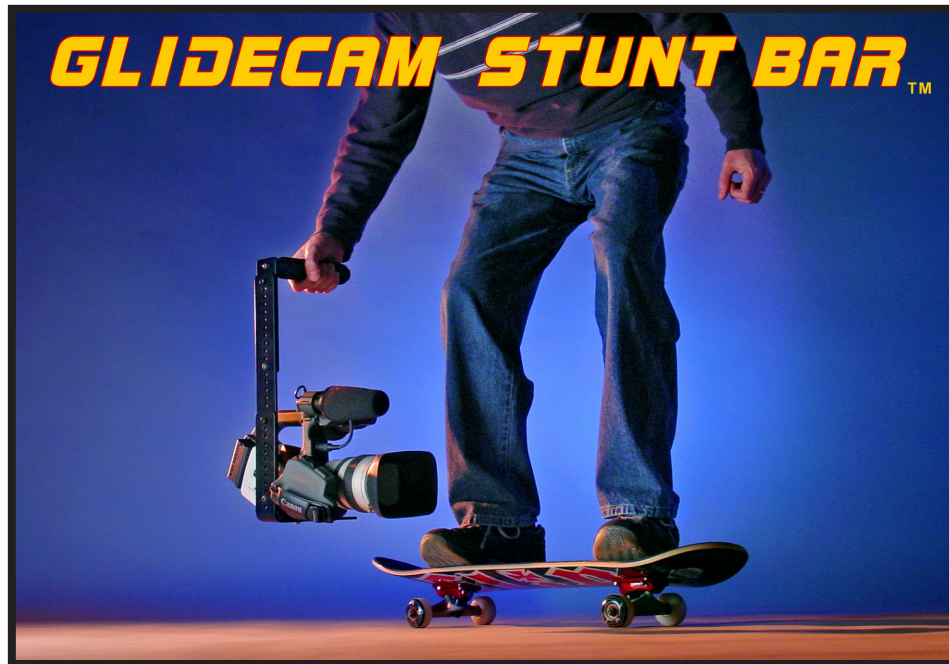
The Glidecam Stunt Bar being used in Low Mode.

The Glidecam Stunt Bar can be used in different ways. See below for the 3 modes of operation.