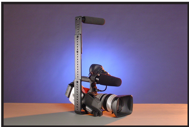
The Glidecam Stunt Bar at 27"