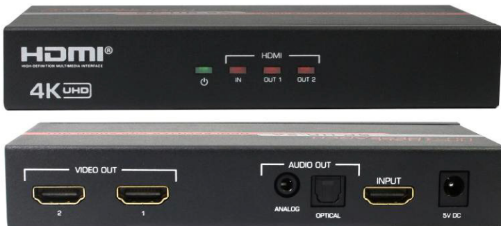
Figure 3 – Front and Rear Panels

If source is sending multi-channel audio, the 3.5mm analog output is muted and extracted audio output will only be available as digital on the TOSLINK optical output.