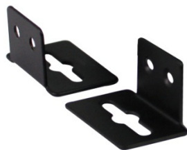
Figure 1 – Included Brackets

For convenience a pair of mounting brackets and hardware are provided so it can be easily surface mounted.