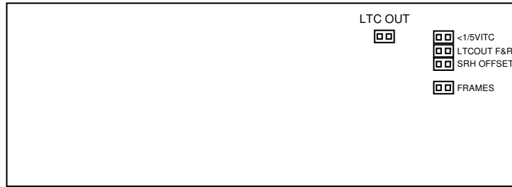
Figure 6-1, Jumper Locations

To access these jumpers, remove the top cover from the TCD-100 by removing the six hex screws. The locations of these jumpers are shown in Figure 6-1.