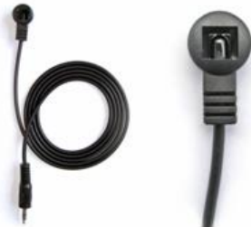
38KHz IR Receiver

NOTE: Be sure the remote control has direct line of sight to the IR receiver end. IR requires open line of sight between the remote and the receiver in order to work properly.