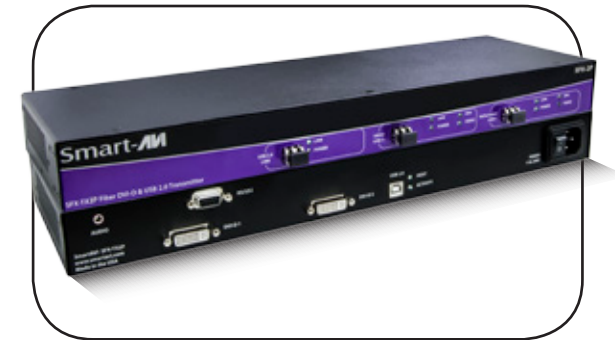
2-Port DVI-D, USB 2.0, Audio and RS232 Fiber Extender