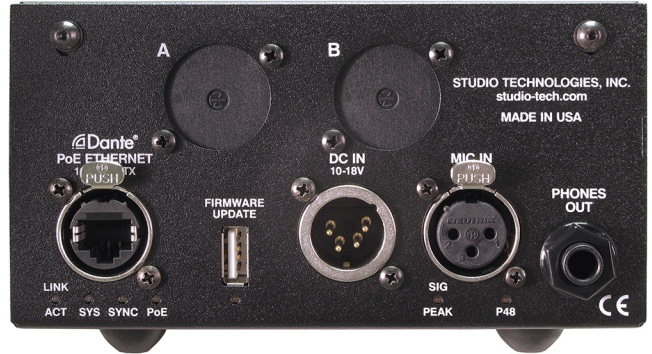
Figure 1. Model 214A Announcer's Console front and back views

power is provided and meets the worldwide P48 standard. A dual-color LED indicator serves as an optimization aid when setting the gain of the microphone preamplifier.