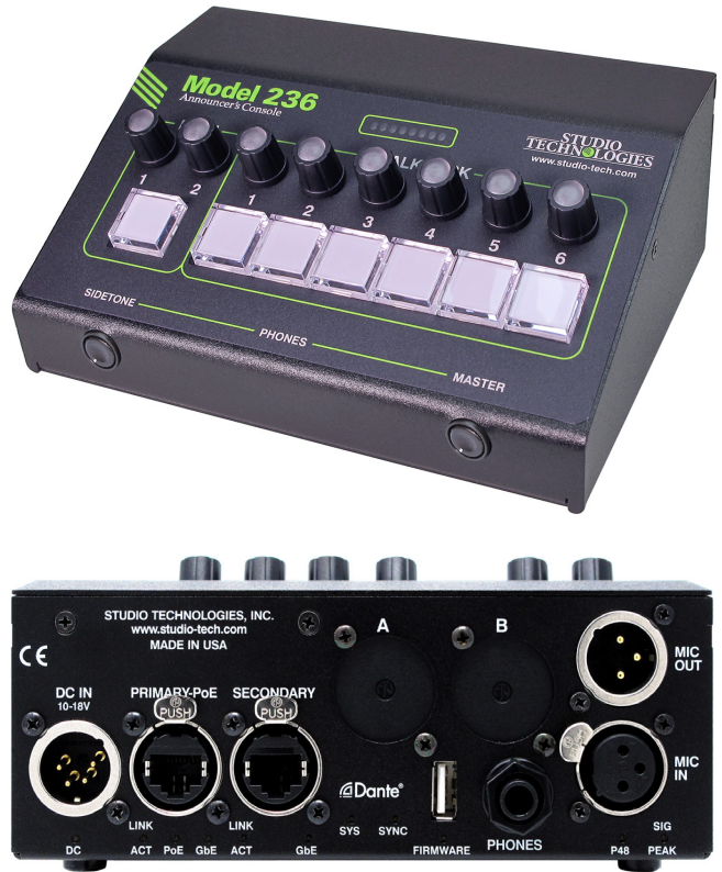
Figure 1. Model 236 Announcer's Console front and back views

The Model 236 was designed to meet two main goals: supporting great audio quality and providing an extensive set of configurable features. Using the latest in audio integrated circuits and advanced 32-bit audio processing, the unit's audio performance should meet or exceed that of any audio console, standalone microphone preamplifier, remote I/O interface, or outboard A/D or D/A converter. With over 40 years of professional audio experience, Studio Technologies takes audio performance seriously! And while providing excellent technical specifications is a "must," a device also has to "sound" good before we feel its design is complete.