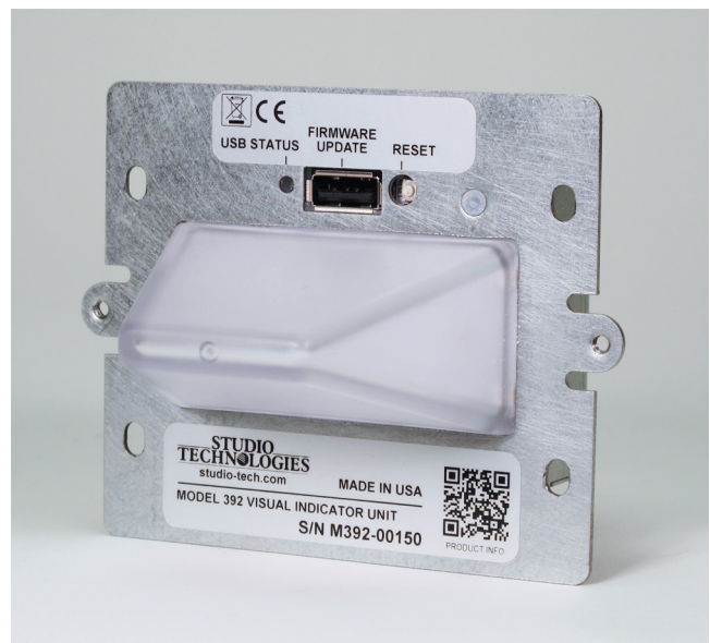
Figure 1. Model 392 Visual Indicator Unit front view

In addition to responding to intercom beltpack call requests, the Model 392 can also be used in other