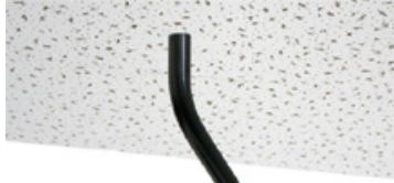
535-2000-294 For Sony BRC Series Cameras