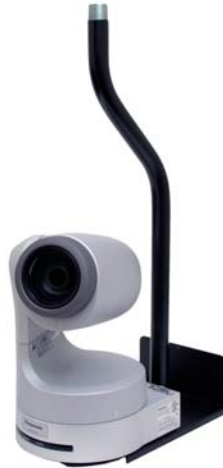
535-2000-295 For Panasonic Camera