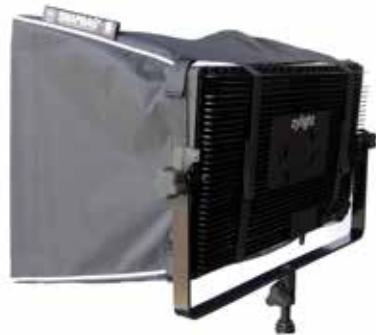
IS3c with DoP Choice Softbox