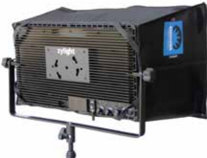
IS3c with Chimera Softbox

The c version of this unit denotes the addition of softbox accessory from Chimera or DoP Choice .