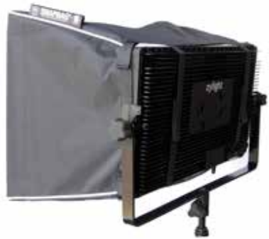
IS3c with DoP Choice Softbox