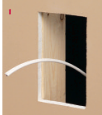
Single-gang installation Cut hole next to stud.