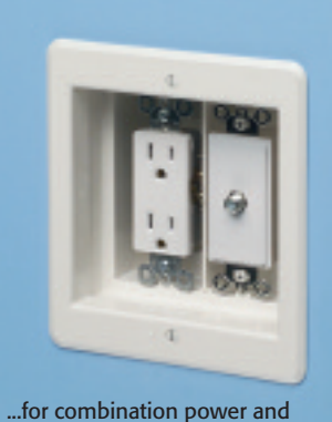
...tor combination power and low voltage device installations.