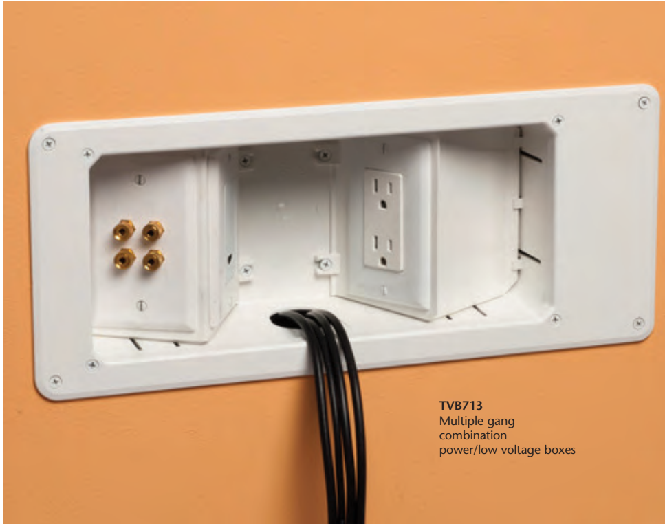
TVB713 Multiple gang combination power/low voltage boxes

For use with close-clearance TV mounting hardware