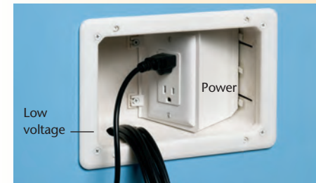
TVB613C Non-metallic cover for TVB713