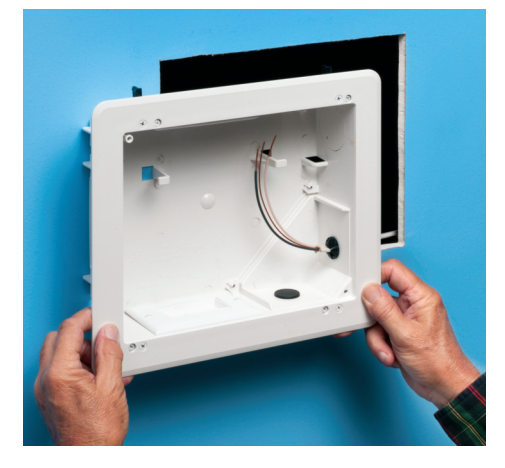
In RETROFIT mounting wing screws hold box secure in wall