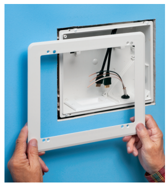
Attach trim plate with screws provided.