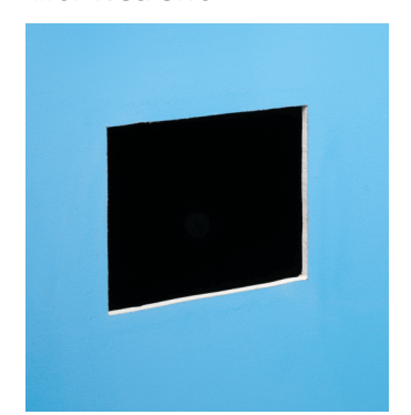
Determine placement of box. Cut opening in drywall.