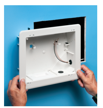
Install trim plate on box. Pull wire. Insert assembly into opening.