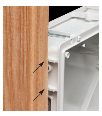
Positioning tabs are set for 1/2" or 5/8" drywall.