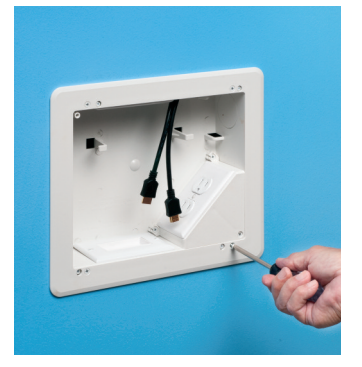
Pull cable. Tighten mounting wing screws to pull box securely against wall.