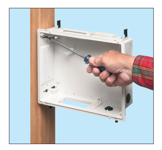
Mounts to stud in NEW work