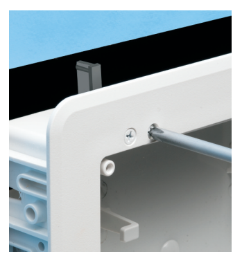
Close-up: Mounting wing screws