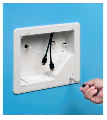
Tighten mounting wing screws to pull box securely against the wall.