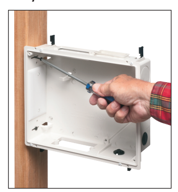
Mount box to stud, using tabs for proper positioning.