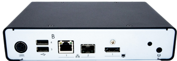
ADDERLink INFINITY 1102 RX - Rear