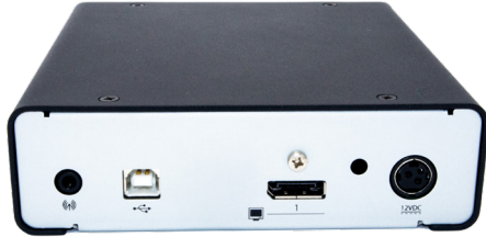
ADDERLink INFINITY 1102 TX - Rear