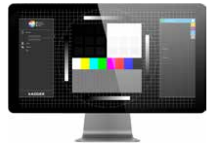
Pictured above: Adder DVA calibration software as part of the Virtual Control App

Virtual control panel app over DDC-CI Adder DVA is supplied with a Virtual Control Panel (VCP) app which allows brightness, tone and sharpness to be adjusted. Vertical and horizontal video alignment can also be adjusted, where necessary. The VCP app contains a test pattern to accurately display the changes. EDID management options can also be changed and the EDID's of the monitors can be displayed.