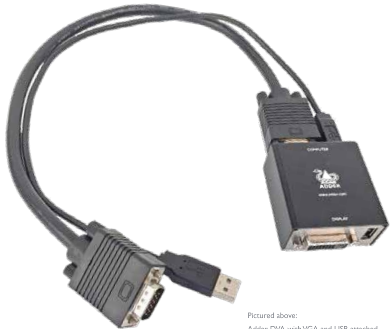
Pictured above: Adder DVA with VGA and USB attached

1 x Adder DVA module 1 x 41cm VGA cable (male to male) 1 x 45cm USB A to B cable