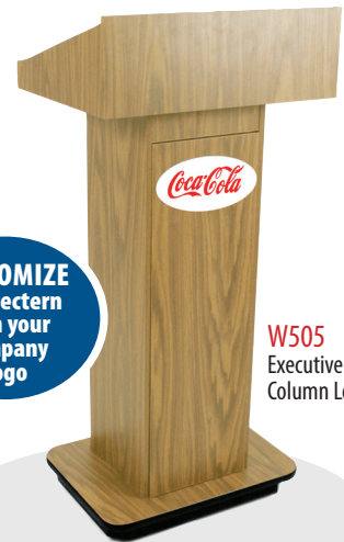
W505 Executive Non-sound Column Lectern

CUSTOMIZE any Lectern with your Company Logo