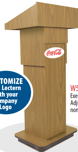
W505A Executive Adjustable Height non-sound Lectern

CUSTOMIZE any Lectern with your Company Logo