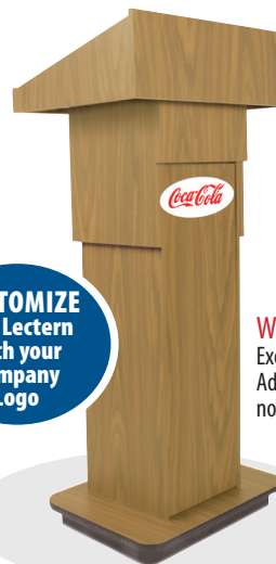
W505A Executive Adjustable Height non-sound Lectern

CUSTOMIZE any Lectern with your Company Logo