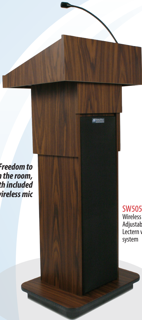
SW505A Wireless Executive Adjustable Height Lectern with sound system

Freedom to roam the room, with included wireless mic