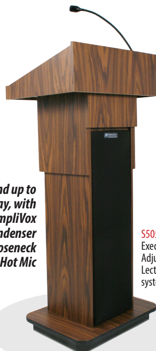
S505A Executive Adjustable Height Lectern with sound system

Stand up to 20" away, with Sensitive AmpliVox Electret Condenser Gooseneck Hot Mic