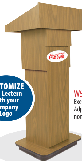
W505A Executive Adjustable Height non-sound Lectern

CUSTOMIZE any Lectern with your Company Logo