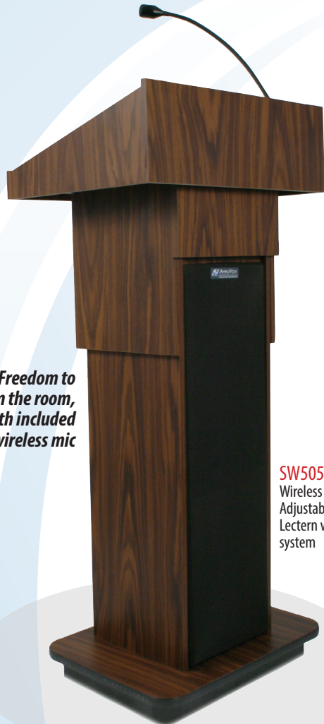
SW505A Wireless Executive Adjustable Height Lectern with sound system

Freedom to roam the room, with included wireless mic