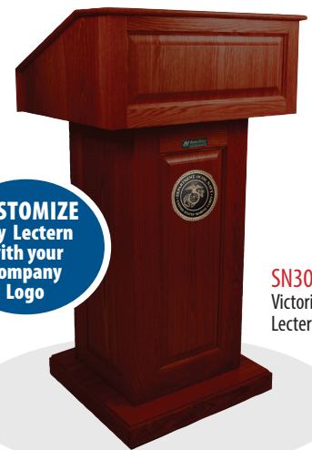
SN3020 Victoria Lectern

CUSTOMIZE any Lectern with your Company Logo