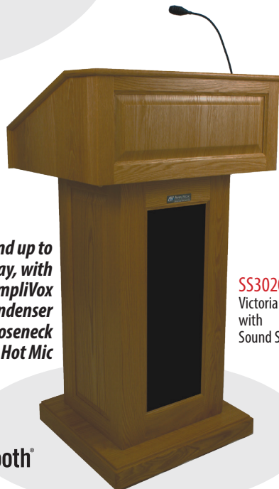
SS3020 Victoria Lectern with Sound System

CUSTOMIZE any Lectern with your Company Logo