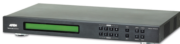
VM5404D Front view