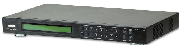
VM5808D Front view