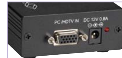
Rear view showing HD15 and power connectors.