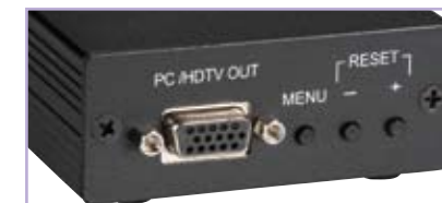
Pushbuttons control on-screen menus.