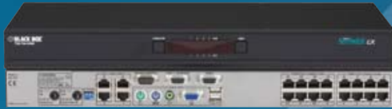
KV0416A: top: front view; bottom: rear view

Size — KV0416A, KV0424A-R2: 1.75"H (1U) x 19"W x 8.5"D (4.4 x 48.3 x 21.6 cm)