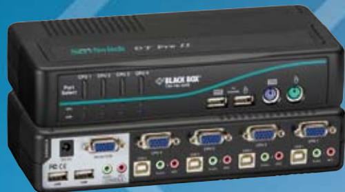
KV7021A: top: front view; bottom: rear view