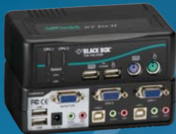
KV7020A: top: front view; bottom: rear view