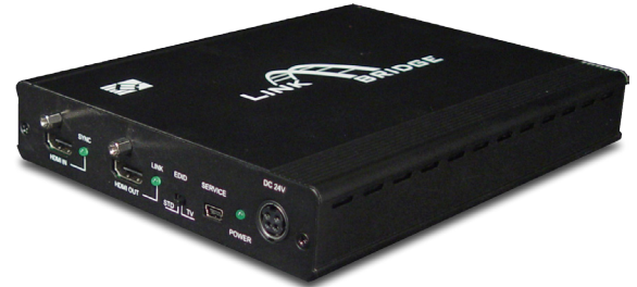
Stand-Alone (HDBT Splitter)