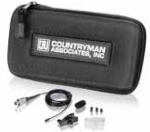
Supplied with carrying case, windscreen, cable clips, protective caps, and detachable connector (if detachable).