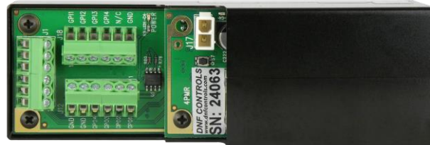
EB-44, EB-42, EB-41 & EG-4