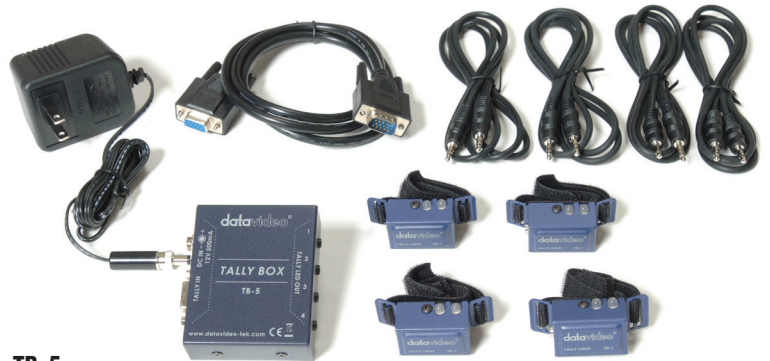
TB-5 Tally Light Kit »