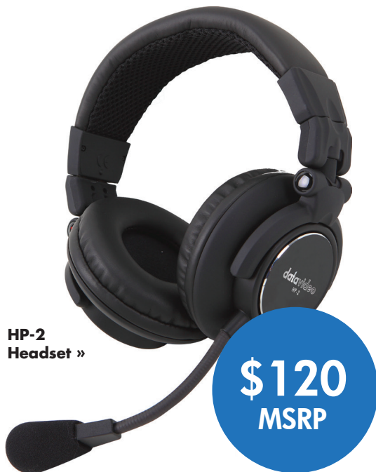
HP-2 Headset »