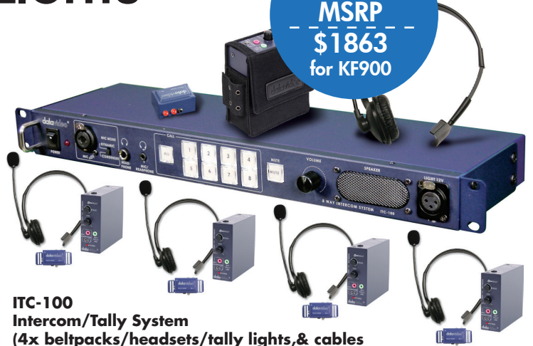
ITC-100 Intercom/Tally System (4x beltpacks/headsets/tally lights,& cables included) »