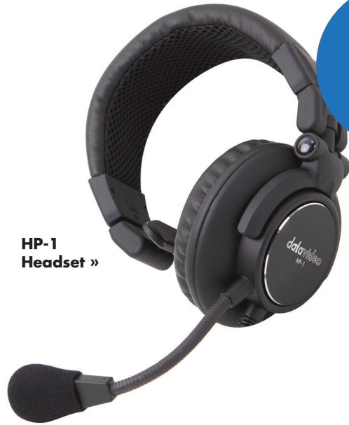
HP-1 Headset »