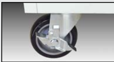
Four 4" swiveling casters (2 with brake locks).

The MCC10 is an affordable solution for charging, securing and transporting up to 30 tablets or netbooks. Rubber coated dividers and padded shelves provide protection to your devices. Plenty of ventilation allows air to circulate freely through the unit. The MCC10 includes a top inner shelf, two 16-outlet vertical electrical outlets and 4" wheels with locking brakes. Front and back doors lock with a traditional key system for secure storage and peace of mind knowing your investment is protected.