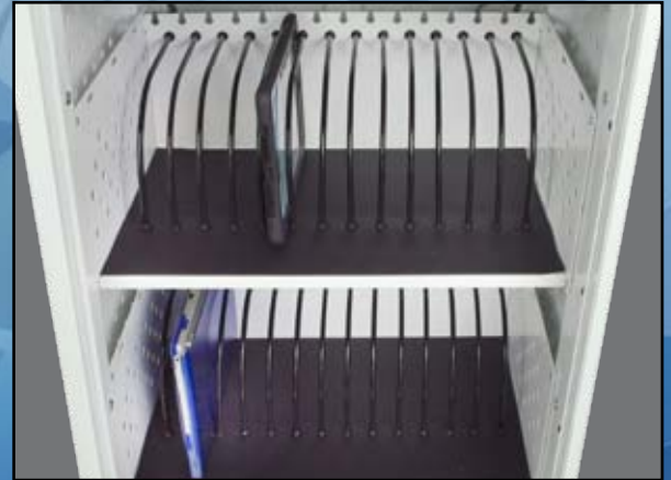
Storage for up to 30 tablets or netbooks