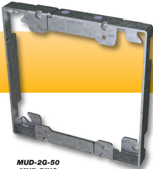
MUD-2G-50 MUD RING 1/2" depth