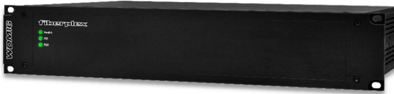
WDM16 Front View

The FiberPlex WDM is an 8 or 16 Channel Active Wavelength Division Multiplexer. Simply put, it is a device which allows the user to combine