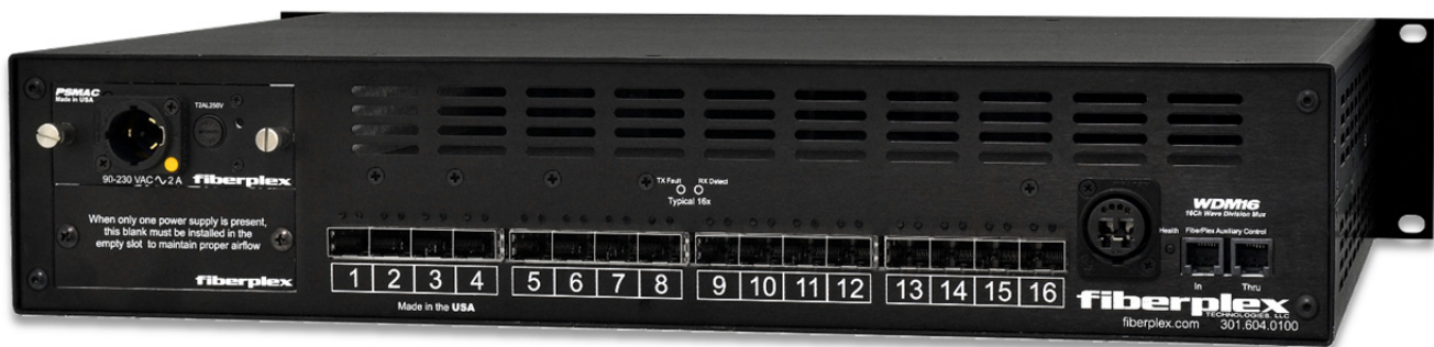
WDM16 Rear View