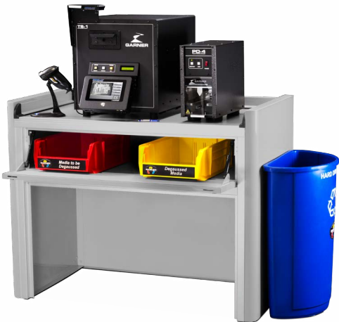
Degauss Destroy Recycle Workstation (DDR-14 IRONCLAD shown)