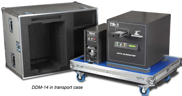
DDM-14 in transport case