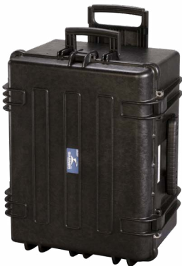
CASE-PD4 MIL SPEC Shipping Case