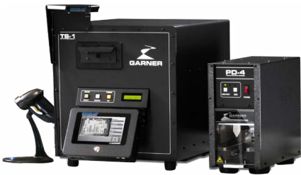
Degauss and Destroy (DD-14 IRONCLAD shown)

Configure a system to match your needs. To ensure data can never be retrieved, pair the PD-4 NSA-listed destroyer with our TS-1 NSA-listed degausser, HD-3WXL high-volume degausser, or HD-2XT high-speed degausser.