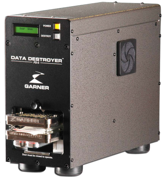
PD-5 with SSD-1 in the destruction chamber