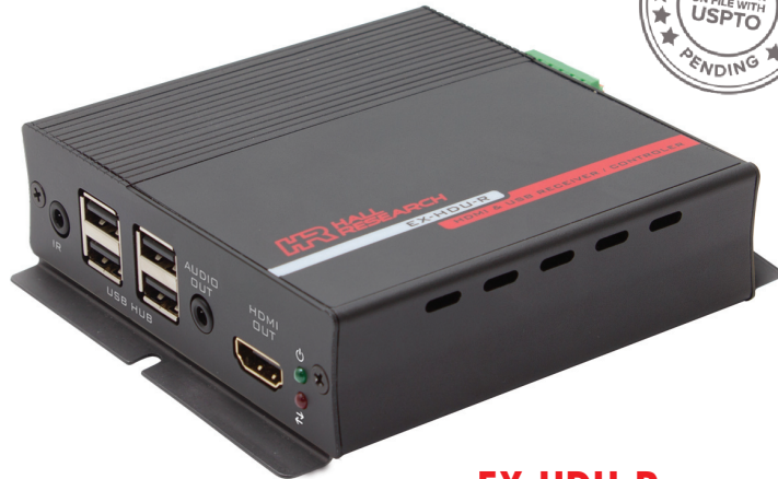
EX-HDU-R Remote Receiver