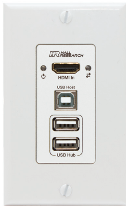
EX-HDU-WP Wall-plate Sender