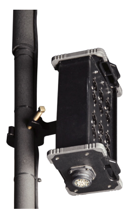
(As shown on model BNJ2-Z3-CLP)

With Thread Adapter for Vertical Mounting