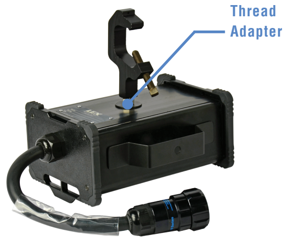
With Thread Adapter for Vertical Mounting