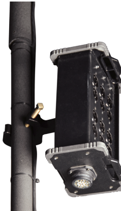
(As shown on model BNJ2-Z3-CLP)