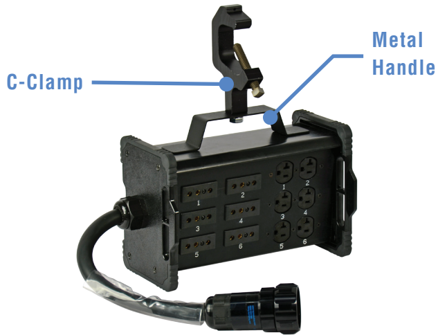
Standard C-Clamp for Horizontal Mounting