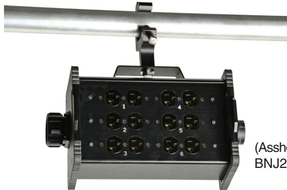
(As shown on model BNJ2-Z3-CLP)