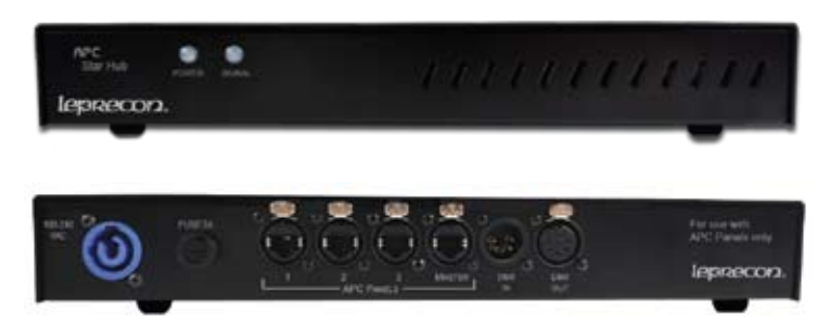
Dimensions are: 12.76" W x 1.72" H x 6.75" D (2.00" H ships with rubber feet).

The APC Star HUB makes it easier than ever to specify and install APC wall panels in a new or existing DMX lighting system. The Star HUB provides DC power, DMX input from a controller, and isolated DMX out to lighting fixtures. The Star HUB includes an internal RDM capable DMX splitter allowing star distribution for up to four wired sets of APC panels.