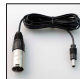
XLR 1000 Use with a standard 4 pin XLR camera battery power source.