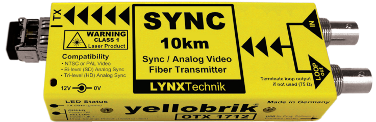
OTX 1712 LC Version Shown

The OTX 1712 provides a passive loop output and support for LC, ST or SC singlemode fiber connections. An LC version suitable for multimode fiber is also available.