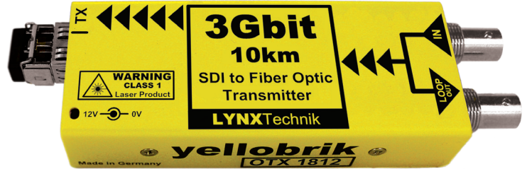
OTX 1812 LC Version Shown

XLR 1000 Use with a standard 4 pin XLR camera battery power source.