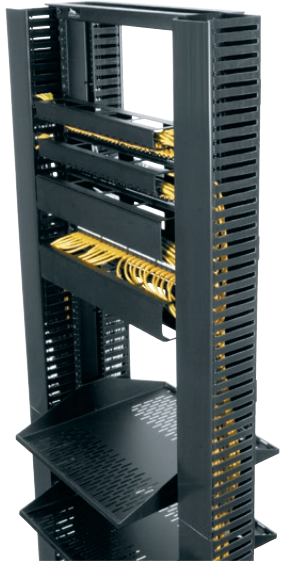
PCD shown on RLA series 2 post rack